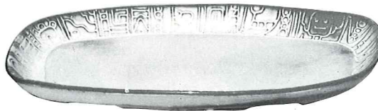
7QS—13" STEAK PLATTER (SHALLOW PLATTER) 5.00