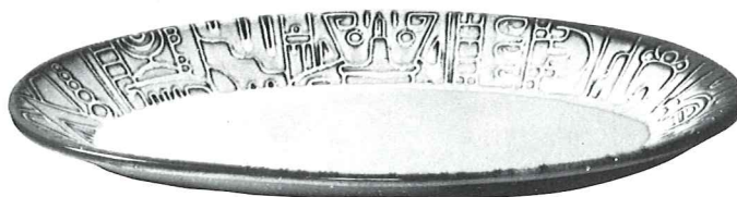
7TP—17" AZTEC OVAL PLATTER 17.50