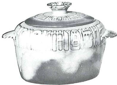
7W—3 QT. BAKER/BEAN POT 13.25 7W/W—BAKER & WARMER, SET 20.50