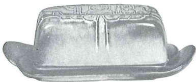
7K—BUTTER DISH 6.50