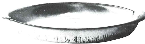
7Q—13" DEEP PLATTER 7.75