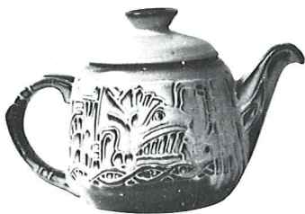
7T—6 CUP TEAPOT 9.25