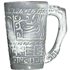
7M—14 OZ. MUG 4.50