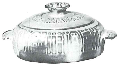
7V—2 QT. BAKER/BEAN POT 9.25 7V/W—BAKER & WARMER, SET 16.50