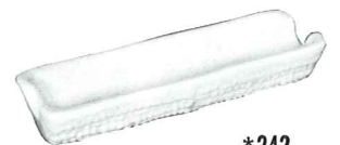
*242 CORN DISH 2.50