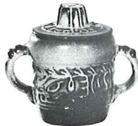
7B—SUGAR WITH LID 5.00