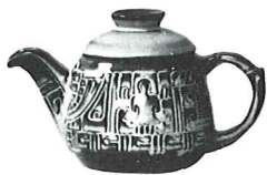
7J—2 CUP TEAPOT 6.50