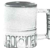
*C4—12 OZ. COFFEE MUG 3.25