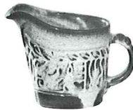
7A—6 OZ. CREAMER 3.25