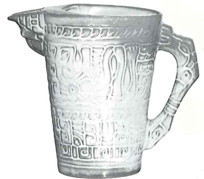
7D—2 QT. PITCHER 9.25